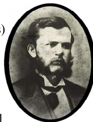
Andrew, Jr. (d. 1879)

1843 Elected U.S. House of Representatives (served 5 terms)